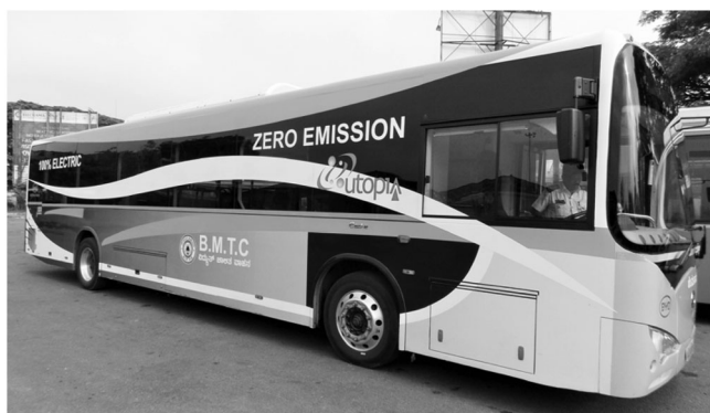
Figure 2. Electric bus introduced by the BMTc.

The travel cost for the diesel bus was calculated by multiplying the cost of 1 litre of high speed diesel (HSD) with the total number of litres consumed by the bus on a particular date. The distance travelled per litre of HSD consumed was calculated by dividing the number of kilometres travelled by the number of litres of HSD consumed. The earning per kilometre for the diesel bus was calculated by dividing the revenue generated by the number of kilometres travelled by the bus on a particular day.